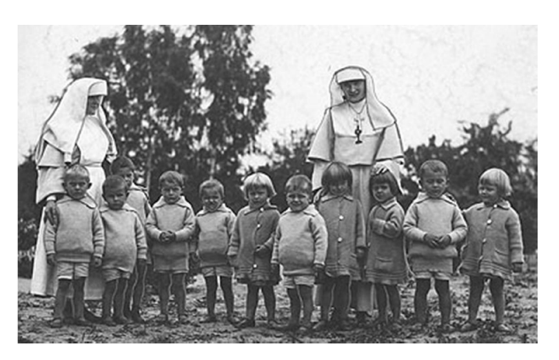
Illustration 3 Mariavite sisters with children

The engagement of the movement in the life of society went far beyond missionary activity and the promotion of certain devotional practices. Work was very highly esteemed and the Mariavite ethos managed to combine mysticism with dedication to welfare and