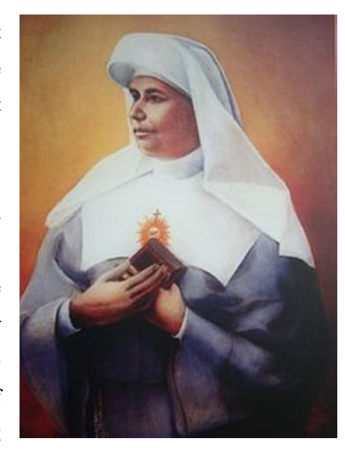
Illustration 2 Maria Feliksa Kozlowska, Mateczka. Mariavite devotional representation.

In the literature, it is usually Marian devotion that is emphasized as characteristic for the movement. Although there is no doubt that it is important, as the invocation of the Mother of God of Perpetual Succor was commended already in the revelations, it is by no means of primary significance for Mariavitism. Of devotional practices, it is rather the "imploring adoration", meant to appease God for the sins and offences of the world and the clergy, that stands out, and the Marian element consists in the adoption of a